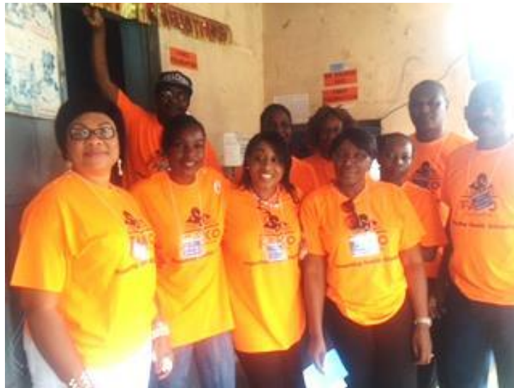
A cross-section of the medical doctors, pharmacists and the foundation's management team at the Bokwaongo free-clinic.

On December 30, 2015 the foundation held a free consultative clinic open to the general public at the Bokwaongo (Wokwaongo) Health Center, Buea. Though this event was open to the general public, it did serve mostly the populations of the Likoko Membea and Wokwaongo Villages. It was a one day clinic that started at 10 am and ended at 6.00 pm.