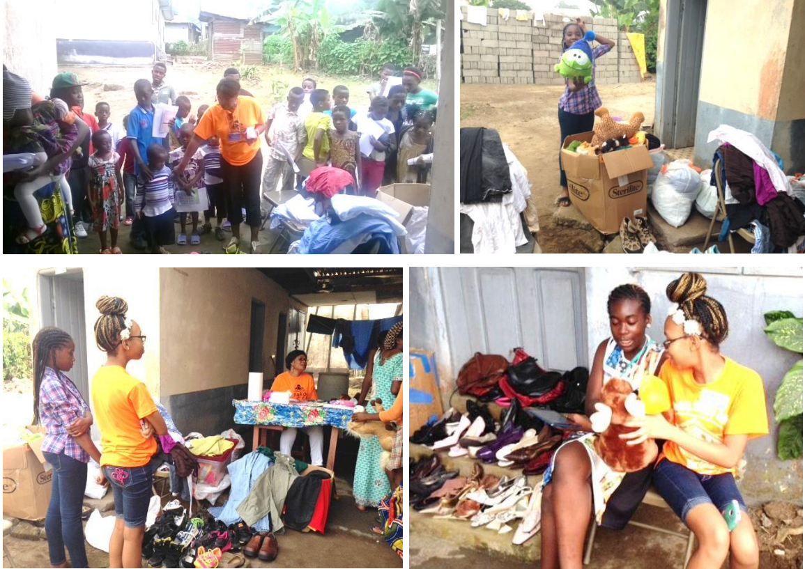
Distribution of freebies goodies