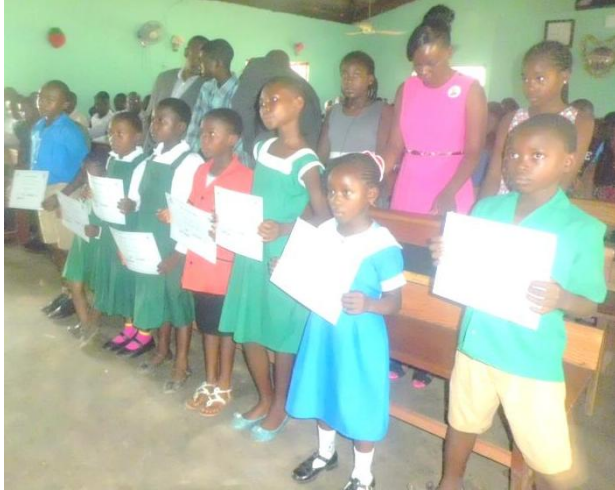
Awardees present their Certificates to the Salem Baptist Church Congregation on December 27, 2015; the congregation felt much honored that they were thought of and also that they were the first beneficiaries of this charitable activity