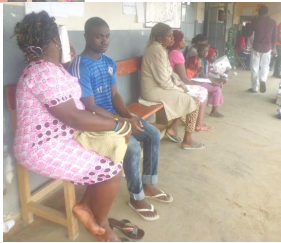
Participants at the free-clinic waiting patiently to advance to the next station of the process. Backups were experienced because of the volume of attendees.